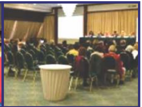
Skopje, North Macedonia