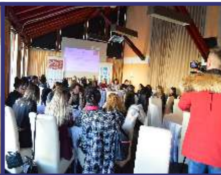
Klllokot, Partesh, Graçanica, Novo Brdo, Kosovo